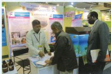
Interaction with foreign delegates