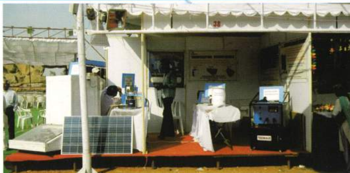
Some of the Solar Powered Gadgets displayed by M/s Teewave Powertech Pvt. Ltd., Hyderabad, at the 'Rural Crafts Mela' held at Rural Technology Park, NIRD, Hyderabad.