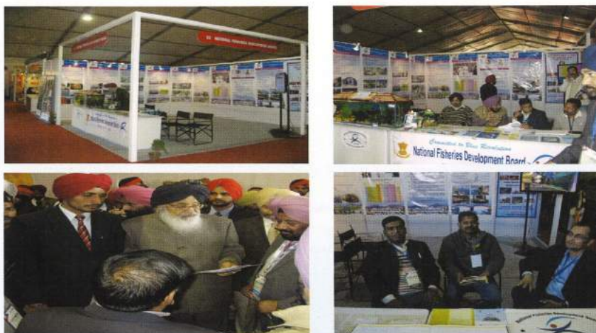
Visit by Shri Prakash Singh Badal, Hon'ble Chief Minister of Punjab, Secretary and other officials/dignitaries, Government of Punjab

'Progressive Punjab Agriculture Summit-2014' was held from 16 th -19 th , February, 2014, at Chappar Chiri, Punjab. Shri Prakash Singh Badal, Hon'ble Chief Minister of Punjab has inaugurated the summit. Shri Raj Naresh Gopal, Senior Executive (Tech.) has participated and set up a stall for showcasing various activities of NFDB. Farmers, agriculture related companies, Government department officials, professionals from different districts of Punjab have participated in the summit.