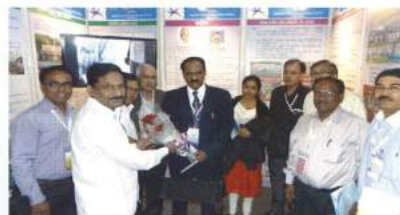
Joint Secretary (Fy), DADF visiting NFDB stall