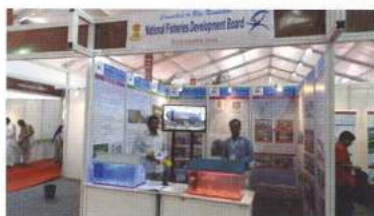
NFDB Stall in Krishi Vasant,