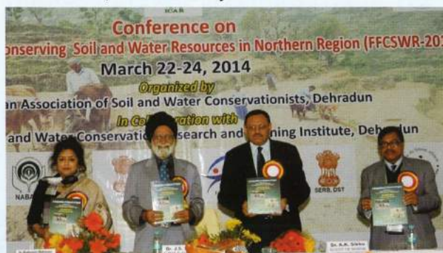
Souvenir being released at the inauguration of FFCSWR-2014 at Dehradun