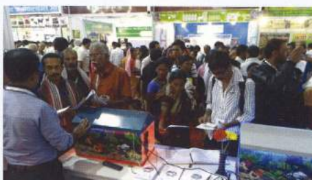
Farmers from Kerala interacting with NFDB officials