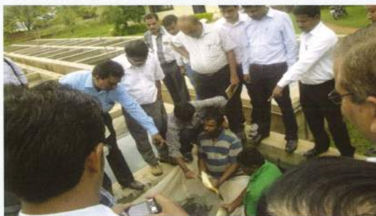
Participants at Amur common carp farm

National Fisheries Development Board (NFDB) has sanctioned a project for Development of brood bank for Amur common carp to KVAFSU, Bengaluru to produce nuclear breeder seed of Amur common carp and supply to States to build brood bank of this new breed and organize workshop. So far, the breeder seed of Amur Common carp has been supplied to Sikkim, Meghalaya, Assam, Manipur, Uttarakhand, Odisha, Maharashtra, Rajasthan, Tamil Nadu and Karnataka States for development of brood stock and its propagation.