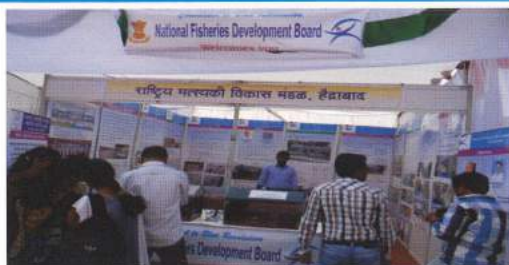
NFDB Stall at the Fish Festival