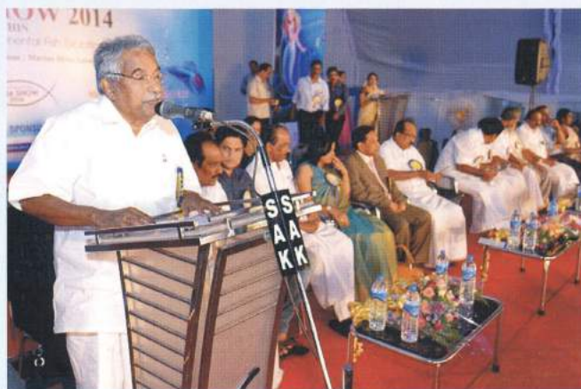
Hon'ble Chief Minister of Kerala, Shri Oommen Chandy and other dignitaries at the inauguration of the Aqua Show “Ornamental Kerala 2014”, at Kochi Kerala

Hon'ble Chief Minister Shri Oommen Chandy addressed the inaugural ceremony Dr. Madhumita Mukerjee, Executive Director, NFDB participated in the inaugural session and presented a paper on “Export Performance of Indian Ornamental Fish-Trend: Analysis” which was published in the Souvenir.