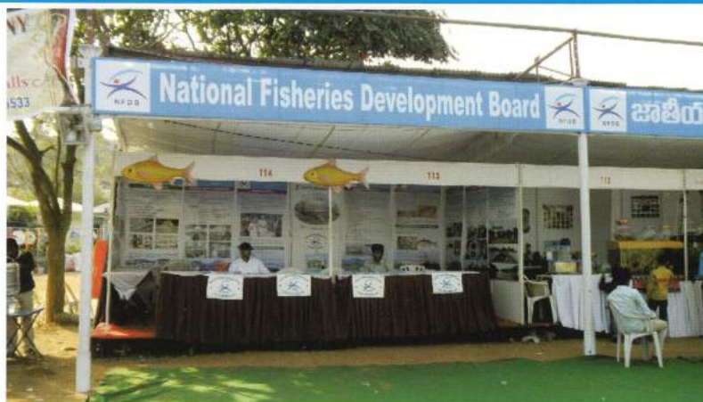
FDB Stall at 'RTPMela' at NIRD, Rajendranagar, Hyderabad