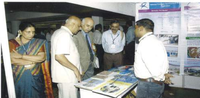
Visit of delegates of the International symposium to NFDB stall